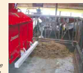
Cross conveyor belt at the back of the machine.