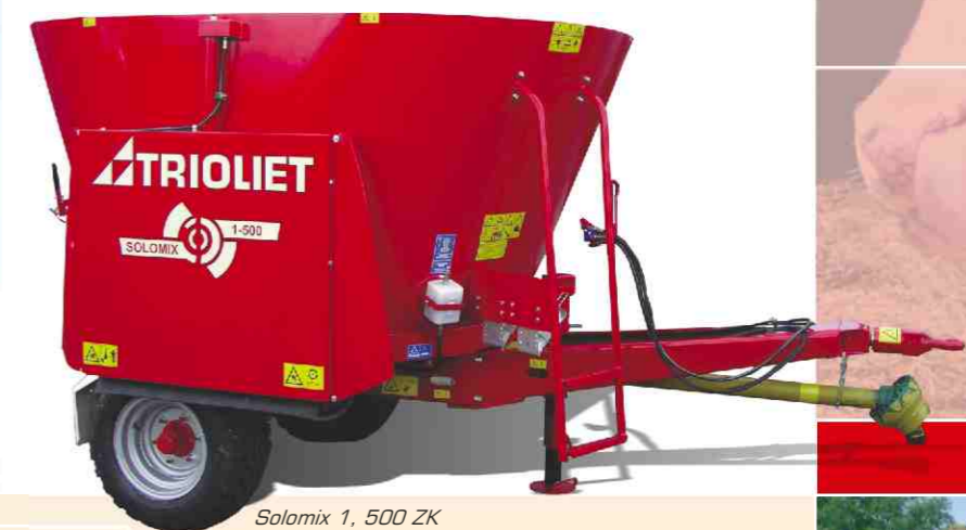
Solomix 1, 500 ZK