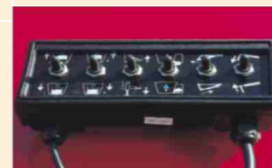
Electric operation as an option.