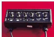
Electric operation as an option.