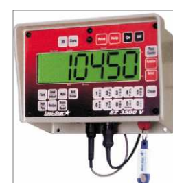
EZ 3500 with datakey, docking station and software as an option.