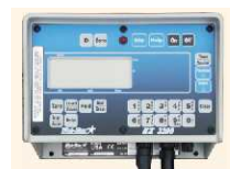
Programmable weighing computer for PC or printer as an option

Correct height of the mixing auger in proportion to the height of the mixing chamber.